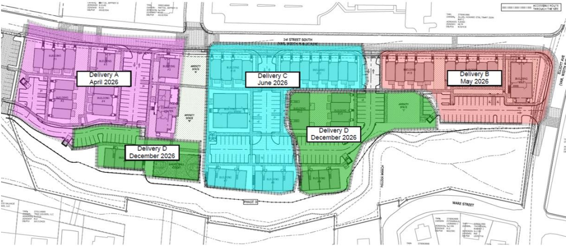
South First Street Phase 2 Phasing Exhibit

Construction of 113 homes, a community center, and CRHA offices by Contour Construction, Urban Core, and Greenwood Homes began in April 2025, progress is seen daily, and the team has kept things on schedule with an early occupancy of a portion of the site targeted for this summer. Returning residents are beginning their process with staff to be ready for their return after school lets out. 12 buildings (out of 19) on all portions of the site are in various stages of construction and heading towards completion of 6 buildings of varying bedroom sizes. Resident Planners have begun a process to develop and select artwork for the new building with an emphasis on community, nature, and historical memory.