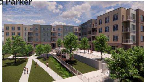
SOUTH - WEST VIEW