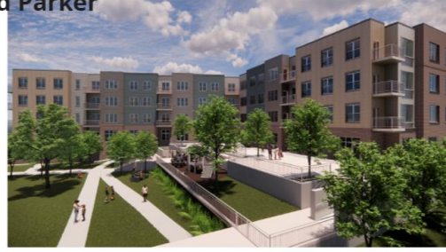
SOUTH - WEST VIEW