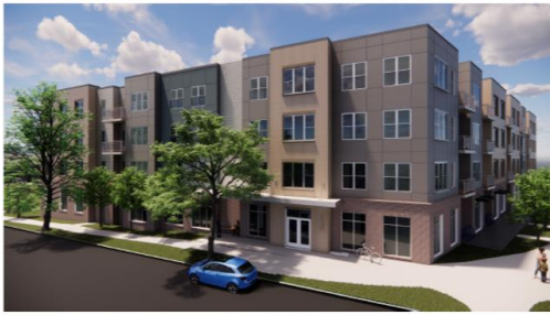
SOUTH - EAST VIEW