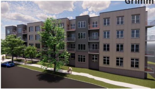
NORTH - WEST VIEW